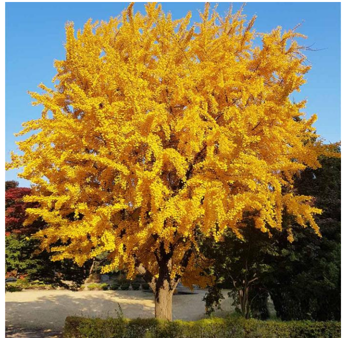
Ginkgo Tree Before it Drops its Leaves

There are over 60,000 species of trees. Trees are the oldest living things on earth. There is a tree 4,800 years old. The rings of a tree can not only tell the tree’s age, but also date events such as drought.